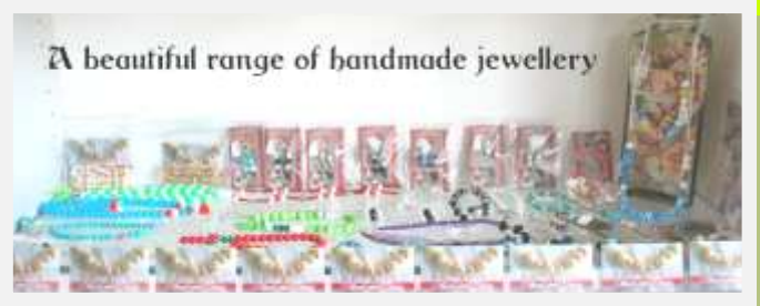
A beautiful range of handmade jewellery