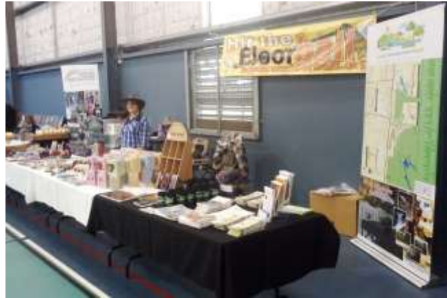
Glades Arts & Produce "Rodeo" Themed Markets