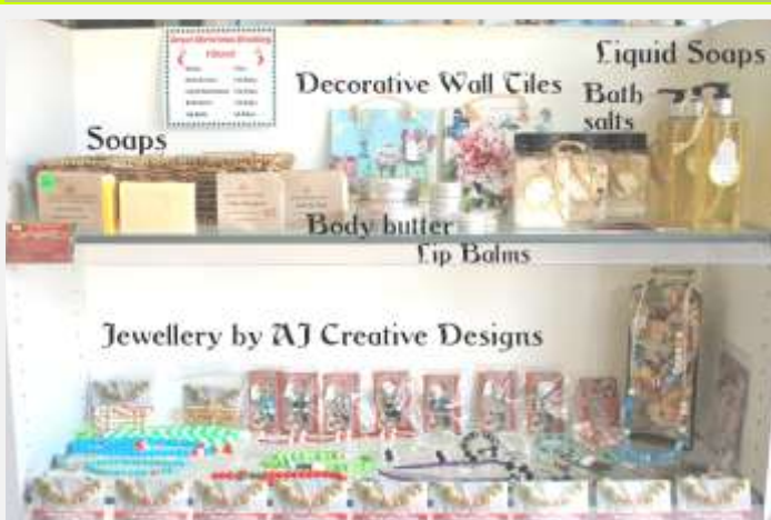
Soaps Liquid Soaps Decorative Wall Tiles Bath salts Body butter Lip Balms