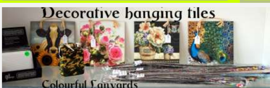
Decorative hanging tiles