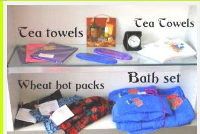
Tea towels Tea Towels Wheat hot packs Bath set