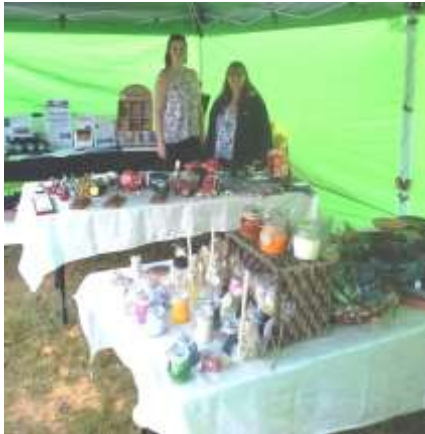
Jarrahdale Log Chop