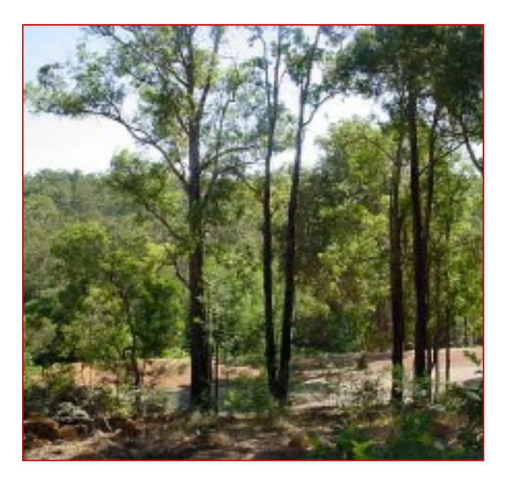
... where the trees are waiting ...

Nestled in the hills of the Darling Scarp, surrounded by Jarrah trees, the Environmental Centre offers a perfect retreat location, within an hour's drive from Perth City.