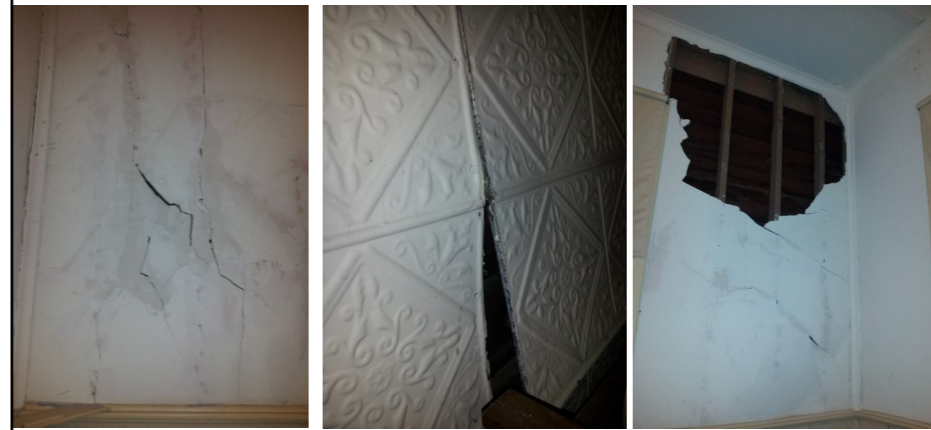
Some of the damage to the interior walls of the church building.

Funding applications are being lodged to finance the urgent re-stumping of the Church. Due to the age of the building, major works are needed to return her to her former glory. Attaining the great age of 109, the building has sunk dramatically, causing damage to the floor and interior. As well as the re-stumping, the wall linings on some of the interior walls need repairing or replacing. Some areas of the ceiling will need repairs in the future. Our funding officers are busy searching to secure finances.