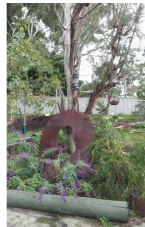
Past and present combine in a lovely garden feature