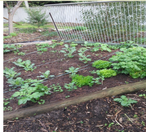
There will be plenty to share around for members

There is nothing quite as good as picked fresh from the garden.