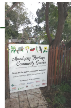
Come in, the gate's open ...

Become a Member! Family: $10 per year Adult: $5 per year