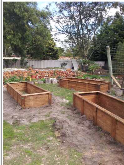
The raised garden beds assembled